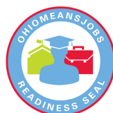
Ohio Means Jobs